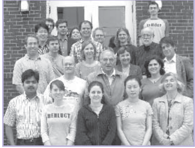
The Department of Earth and Planetary Sciences, May 2007.

Before I begin recounting the recent activities of our department members, though, let me once again extend a resounding thank you for last year's unprecedented level of alumni giving. I am proud to report that the percentage of EPS alumni donating in 2006 was the highest in WCAS. Additionally, the total amount raised surpassed our previous departmental high for an annual solicitation. Your support has been instrumental in helping us offset the costs as-